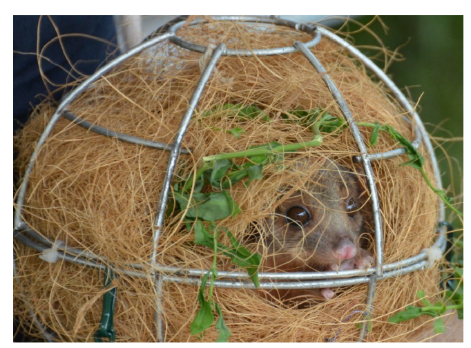
Ringtail possums are rescued, treated and released. Volunteers often make dreys for possums who lose their homes.

There was a major shooting of Eastern water dragons in Jan 2022 during which a number of animals were injured. Volunteers hunted for the injured animals and brought them back for treatment by the Vet. Margaret housed them until they were ready to be released.