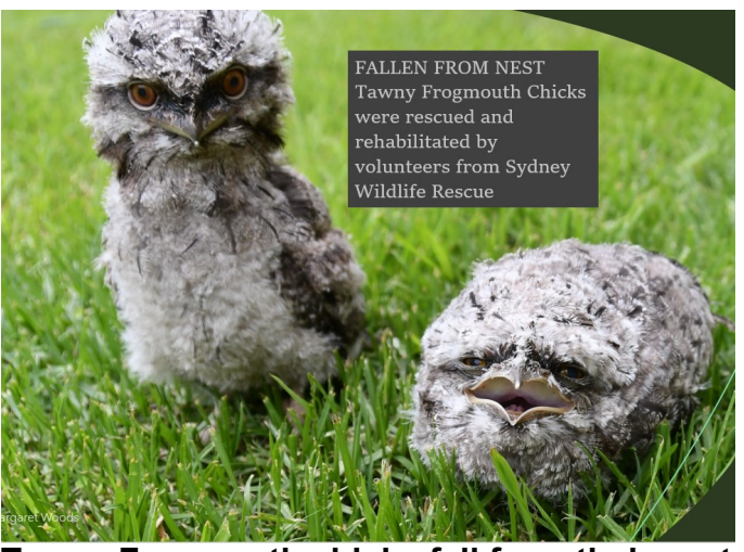
Tawny Frogmouth chicks fell from their nest.