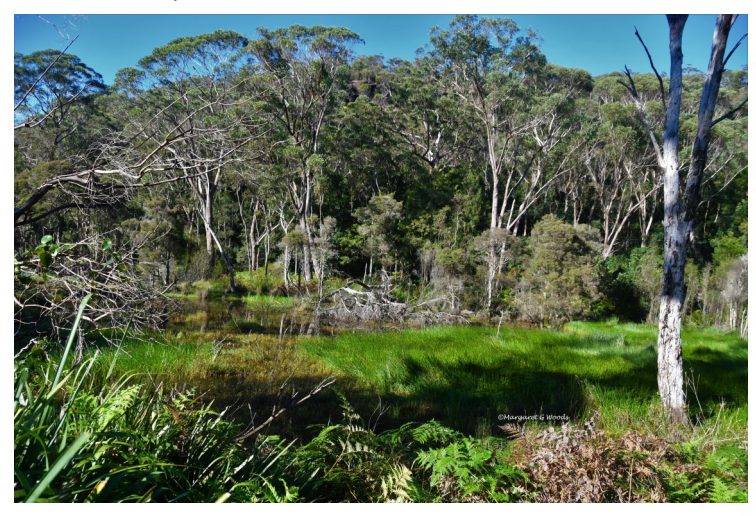
Bushland next to Wakehurst Parkway: Photo: Marg Woods

The environmental constraints are considerable—the road goes through valuable and sensitive ecosystems that contain threatened species.