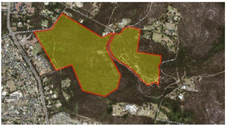
Map showing proposed suburban development near Lizard Rock. Forest Way is near the left of the map. Morgan Rd is at the north of the proposed area and continues south through the middle of the proposed area.

Don't miss it! Register now. By emailing .... email@narrabeenlagoon.org.au