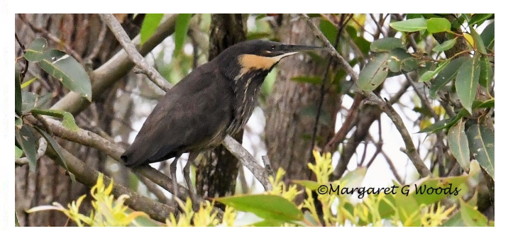
Black Bittern in Warriewood Wetlands near Narrabeen Lagoon