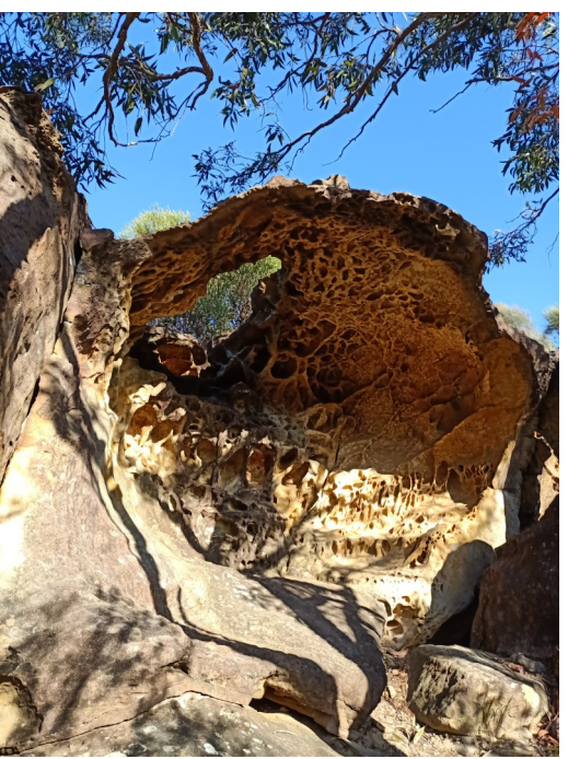
Sandstone overhang in Narrabeen Lagoon Catchment

Don't miss it! Register now. By emailing .... email@narrabeenlagoon.org.au