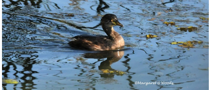
Grebe swimming in Narrabeen Lagoon