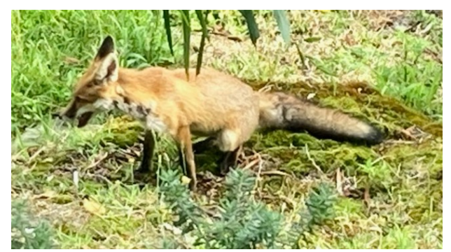
Fox near Narrabeen Lagoon