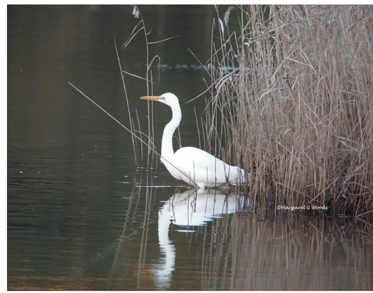
Great Egret in the reeds of Narrabeen Lagoon