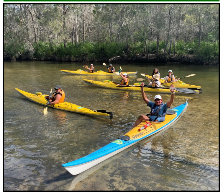
Kayaking in Deep Creek