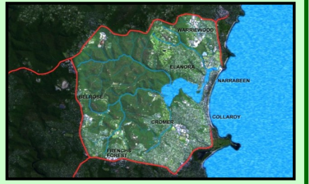
Narrabeen Lagoon Catchment