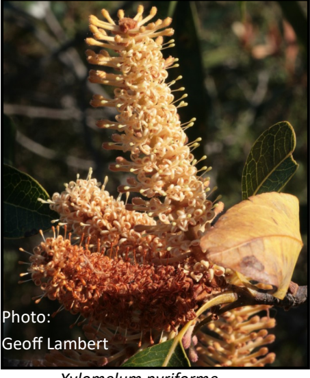
Xylomelum pyriforme Woody Pear

When you register, you will be emailed a link by which you can join the Zoom session at 7pm on November 30.