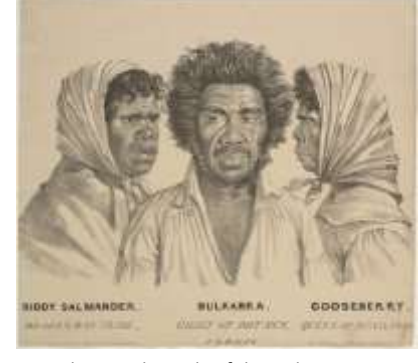
Aboriginal people of the Sydney area.

The Coastal Environment Centre is adjacent to the Narrabeen Caravan Park near where Narrabeen Lagoon joins the sea.