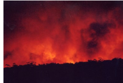
Power supplies are threatened by major events e.g. storms and bushfire

7pm Monday Aug 22 2016 Coastal Environment Centre Pelican Path, Lake Park Road, Narrabeen