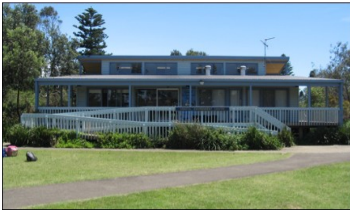
The Coastal Environment Centre is adjacent to the Narrabeen Caravan Park near where Narrabeen Lagoon joins the sea.