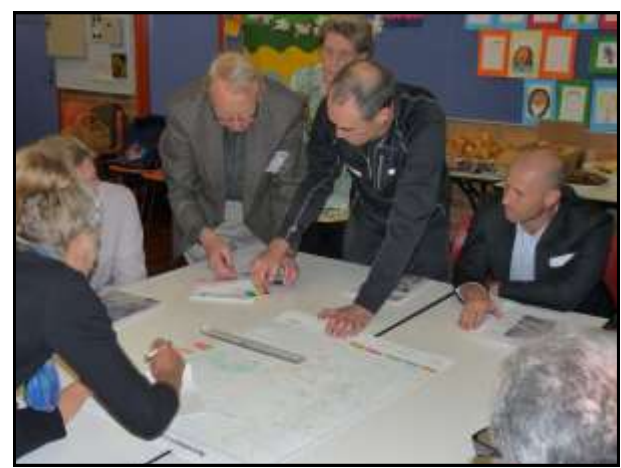
People marking up a map and discussing issues

The 77 people gathered at our August forum marked on the maps the locations of valuable flora, fauna and heritage. They also identified many management issues in the catchment that we are endeavouring to follow up with the relevant landowners or authorities.