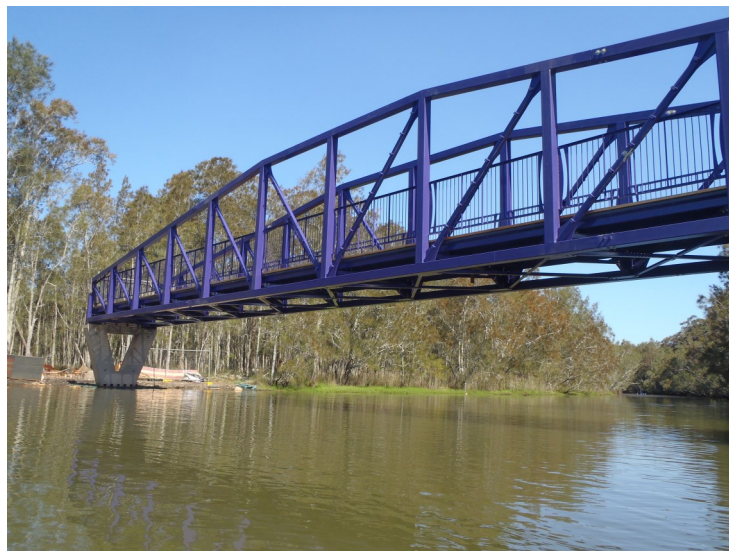
Bridge over South Creek waiting for an approach