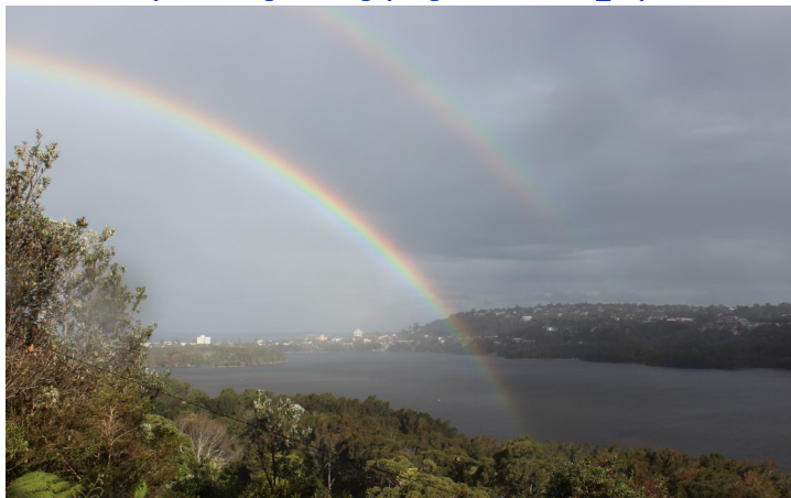
Double rainbow over Narrabeen Lagoon

www.worldparkscongress.org/programme/field_trips.html