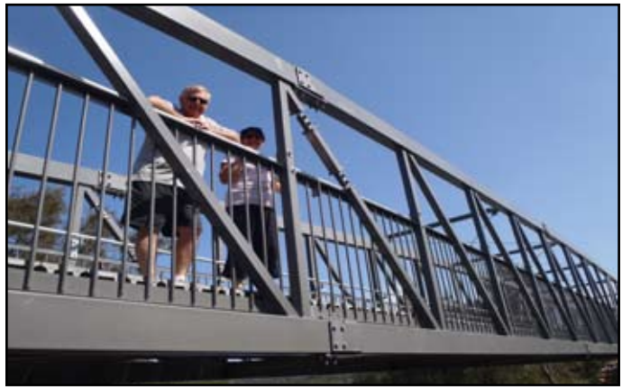
The completed bridge over Deep Creek

The plans for Middle Creek Reserve have been finalised. The bridge over Deep Creek is finished. The official opening for Stage 1 of the Narrabeen Lagoon Trail and Deep Creek Bridge will be Oct 13 at Middle Creek Reserve at 10:30am. RSVP before Oct 10 by phoning 9942 2502 if you plan to attend.