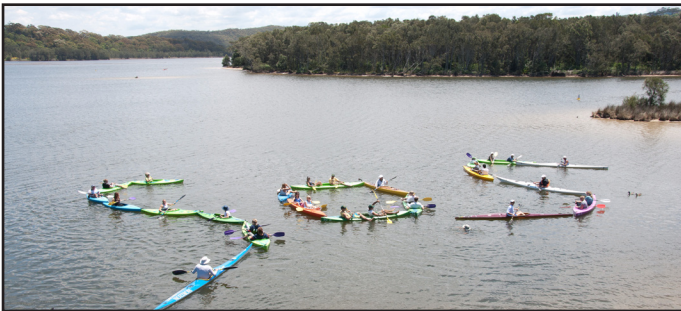
Kayakers forming "SOS" on Narrabeen Lagoon in an effort to have Narrabeen State Park established

7-9pm Monday Aug 22 Upstairs at the Tramshed