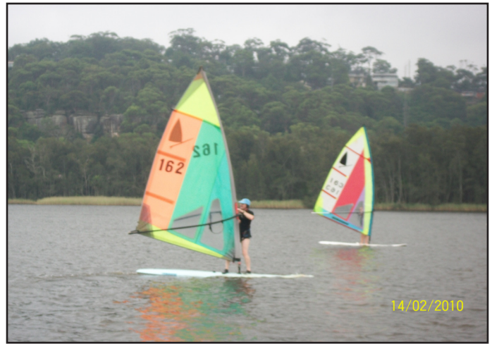
Sail boarders on Narrabeen Lagoon

$ 22.00 from the Coastal Environment Centre, Lake Park Road, Narrabeen 2101.